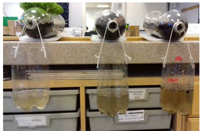
Figure 5 - We observed a difference in both the colour (or turbidity) and the volume of water collected from the three bottles.