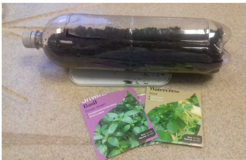
Figure 1 - Bottle with compost added and selection of seeds.

At SSERC we have taken one classroom activity designed to demonstrate soil erosion [4] tested it and made some modifications to improve the effectiveness of the model.