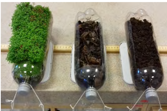
Figure 4 - showing bottles raised by the metre stick.

Deforestation and soil erosion could form part of a wider climate change project - SSERC is supporting the Children’s Conference at the Primary Science Education Conference (PSEC) in June 2019. Find out more in the article from PSTT in this bulletin. >>