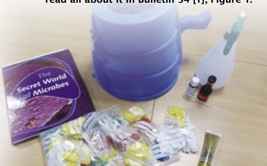
Figure 2 - Contents of a SSERC Meet box (Microbes for Minors).

Those of you who are interested in our development of the Weather and Climate Cookalong Glow_Meet can read all about it in Bulletin 54 [1], Figure 1.