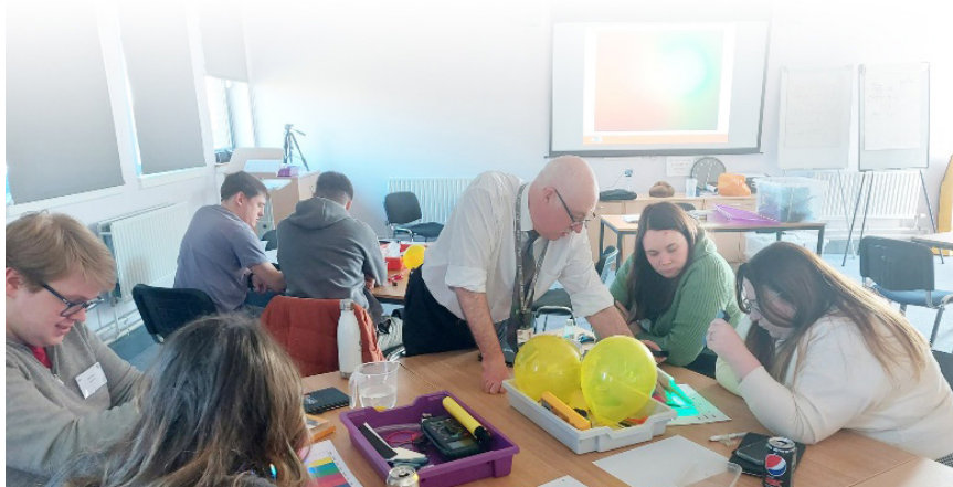
The physics workshops were great fun and the teacher had a great way of getting people engaged in the concepts we were discussing.

I would recommend any teacher or technician make use of the SSERC resources that are freely available on the website. I would also thoroughly recommend the course to any probationer and very much look forward to attending other course with SSERC throughout my career, they provide inspiration as well as support to my own learning and my teaching practice. >>