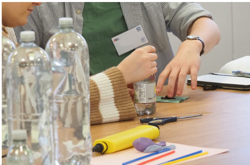
The physics workshop.

Both these workshops categorically demonstrated the versatility of microscale experiments and apparatus. Not only will they keep costs down, it also makes practical activities safer, easier to manage, minimises waste, reduces time spent repeating measurements and cleaning apparatus, and can be linked to environmental sustainability.