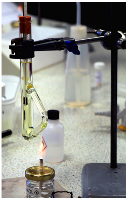
Figure 4 - A Thiele tube in use.

It is possible, if even a Thiele tube is too expensive, to just use an ordinary boiling tube, again with a capillary tube fixed to a thermometer. But this is even harder to control to get a good result.