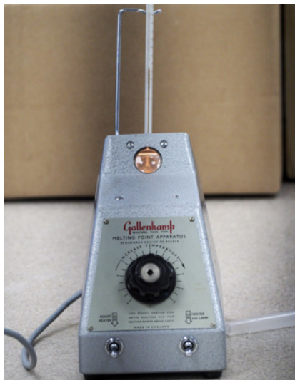
Figure 1 - Old MP apparatus.

Older, or budget, apparatus (like the one in Figure 1) is almost entirely manual. You have to manually control the rate of heating.