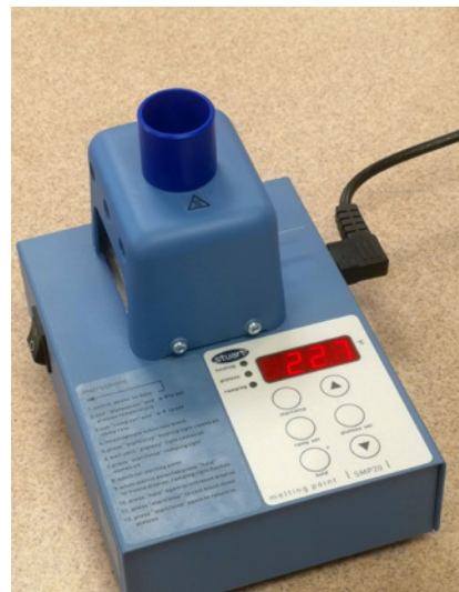
Figure 2 - A more modern device.

It consists of a block of solid aluminium with a hole drilled in at an angle for a thermometer. You place a thermometer in the diagonal hole and put a small pile of your solid in the middle of the block.