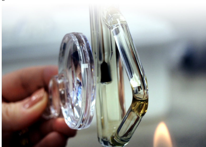
Figure 5 - Taking a reading from a Thiele tube.

We find the best option is to cut a small loop off a length of silicone tubing as a rubber band has a tendency to degrade and break in the oil.