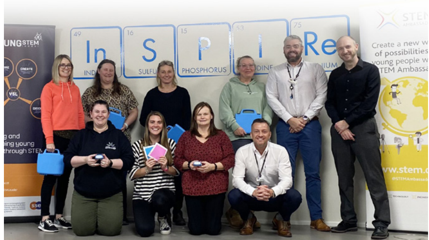
Figure 6 - Professional learning event at Dundee Science Centre with SSERC staff and partnership school leads.

This two-year partnership is focussing on digital technology in year one within the primary school setting and launched in the autumn of 2022. Two schools from Dundee City Council along with four schools in Angus, are working with SSERC to build resources and skills to bring robotics and technology into the classroom, allowing young people to go on and lead learning in this area. Dundee Science Centre is also supporting our partnership (Figure 6).