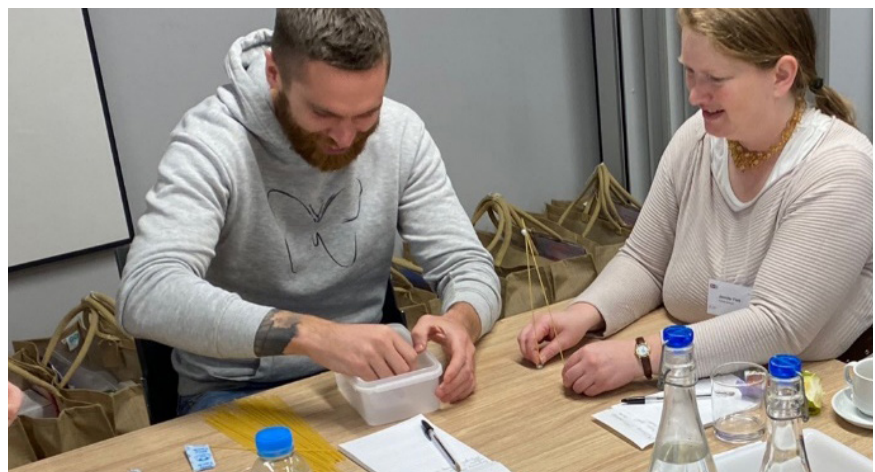
Figure 7 - Professional learning event at Aberdeen Science Centre with SSERC staff and partnership school leads.