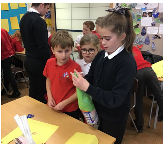
Figure 8 - YSLs at Ross High School in Tranent led bottle rocket and mentos and coke activities with feeder primaries.

Find out more about the programme at www.youngstemleader.scot