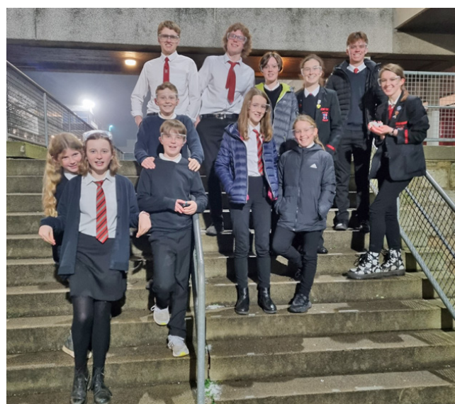
Figure 9 - Senior pupils at Balwearie High School in Kirkcaldy led pop rocket and make a Mars Rover activities with their STEM club.