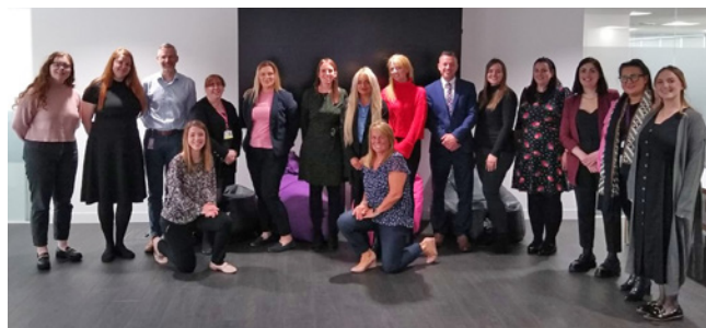
Figure 2 - The Teacher Launch at Leidos HQ.

existing fossil fuel power station to become a cleaner and greener energy source. The teams are working on their solutions whilst being mentored by the Neptune team. The final showcase of their solutions will take place in Neptune HQ in Aberdeen City in March 2023 (Figure 3). >>