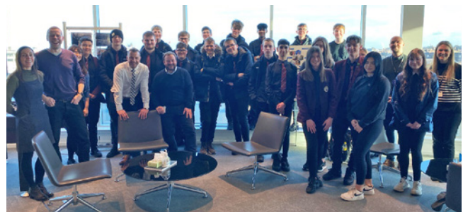
Figure 3 - Neptune Energy Challenge launch event.