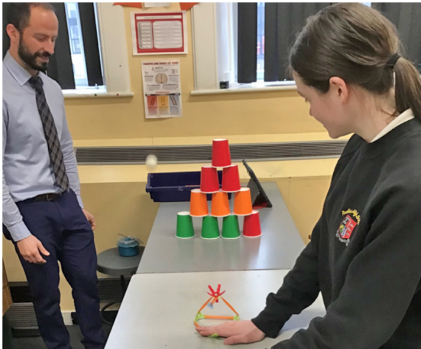
Figure 10 - Peebles High School YSLs bought Strawbees building kits with their grant and ran experiments making catapults and changing different variables to see the effects on launches.

Get started by registering as an educator at www.stem.org.uk/stem-ambassadors