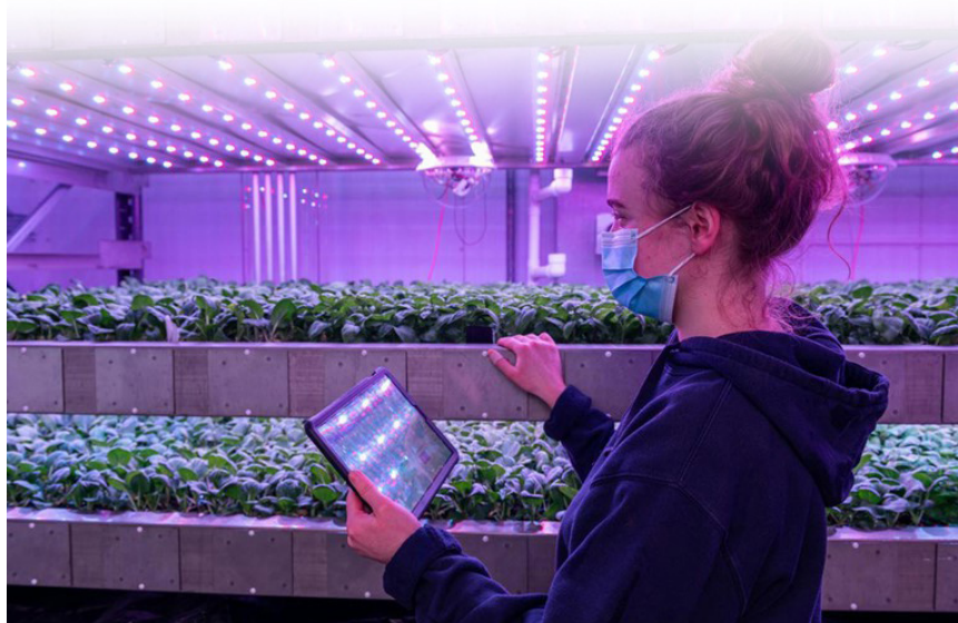
Figure 1 - IGS are an Edinburgh-based company that uses sensor data to monitor and develop smart systems for vertical farming, with the aim of tackling food shortages and climate change.

In Scotland alone, there are lots of companies using data in incredible ways to solve some of the world's most pressing problems. A few examples are: IGS, an Edinburgh-based company using sensor data to develop smart systems for vertical farming, with the aim of tackling food shortage and climate change (Figure 1); Space Intelligence, who use satellite imaging data to work out the best places to plant carbon-capturing forests; and Skyrora Design, a literal rocket science company that carefully monitors