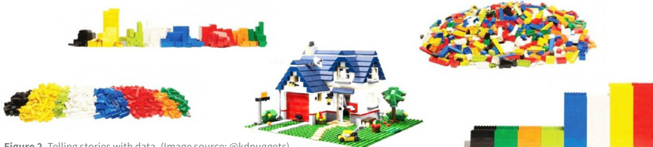
Figure 2 - Telling stories with data.

You might assume that teaching data skills would most naturally sit in the context of numeracy, but teachers are very likely already teaching aspects of data literacy in other subjects, such as maths, social sciences, geography, modern studies, environmental science, >>