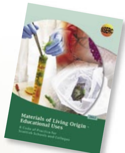
Figure 10 - Materials of Living Origin: A Code of Practice for Scottish Schools and Colleges [8].