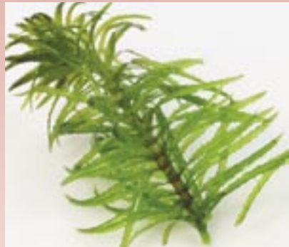
Figure 8 - Egeria najas .

meantime Egeria najas will serve the purpose, but it should be used on the understanding that care should be taken not to release it to the environment. This is also a point to be highlighted to students. The Code of Practice, Materials of Living Origin [8] (Figure 10) states in