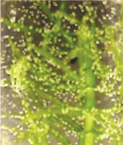
Figure 4 - Egeria najas in bright light releasing oxygen-rich bubbles.

Egeria densa and Elodea when it is out of water.