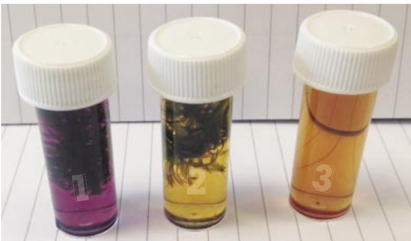
Figure 6 - Egeria najas and hydrogencarbonate indicator: 1) In bright light for 30 minutes; 2) In darkness for 30 minutes; 3) Hydrogencarbonate indicator.

Since Egeria najas , is a non-native species, it may yet join Cabomba caroliniana on the EU list of invasive alien species not to be kept or supplied, the Biology Team within SSERC will continue the quest for a native substitute aquatic oxygenator with which to have photosynthetic fun. In the