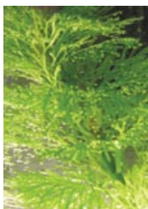
Figure 2 - Cabomba caroliniana in bright light releasing oxygen-rich bubbles.