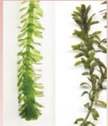
Figure 9 - Egeria densa .

Figure 7 - Effect of irradiation (4 hours) on Egeria densa /hydrogencarbonate mixtures (Figure 7). Prior to irradiation the pH was measured to be 7.4. (i) Upper portion of cylinder covered with black paper during irradiation, (ii) middle portion of cylinder covered with 50% neutral density filter during irradiation, and (iii) lower portion of cylinder uncovered during irradiation after 4 hours irradiation.