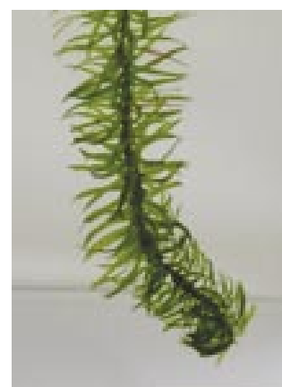
Figure 3 - Egeria najas .