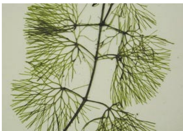
Figure 1 - Cabomba caroliniana .

We have also used Egeria najas as a successful substitute in our ‘ Cabomba towers’ [5] (Figure 7) and have found that it is sturdy and more easy handled than Cabomba ,