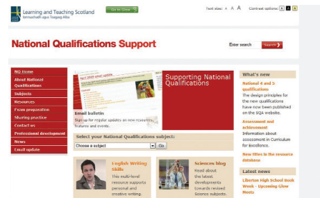
Figure 1 - National Qualifications Support at LT Scotland