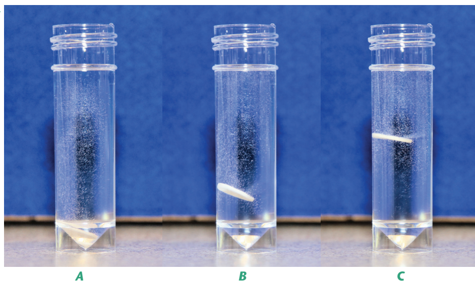
Figure 1 - A single drop of a 1% suspension of yeast has been added to a filter disc and then placed in a 1% solution of hydrogen peroxide. Photographs were taken at (approximately) 3 s (A), 8 s (B) and 13 s (C).

Liver contains a lot of catalase and this can be related to the role of the liver in the removal of toxins from the body. It would be interesting to use a variety of different animal tissues (e.g. kidney, muscle) and make comparisons of catalase levels. However, it is worth noting that the biological significance of catalase is quite complex; for example it appears that some organisms deficient in catalase can survive with little or no harmful consequences [4]. Some additional information on the role of catalase in plants is available [5].