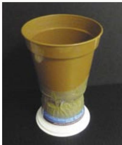
Figure 2 - Secure the two pots with parcel tape.