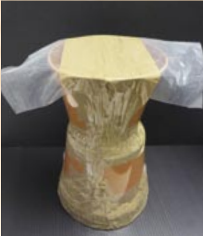
Figure 4 - Stretch plastic over the top.