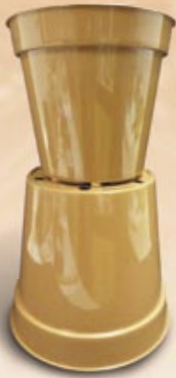
Figure 1 - Place two flower pots together.

All learners should be given the opportunity to make and play a variety of instruments - observing that vibrations give rise to sound. Learners should be able to demonstrate different pitches produced and show how the pitch can be changed. Pitch is governed by the number of sound waves produced per second by the vibrating object - fewer waves per second for a low pitched sound compared to that of a higher pitched sound. The number of waves produced each second is called frequency.