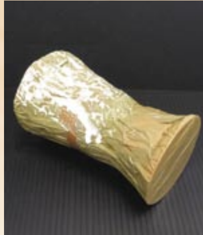
Figure 5 - A section is coated with glue mixture.