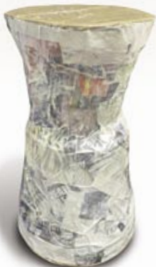
Figure 7 - Keep top and bottom clear of glue.