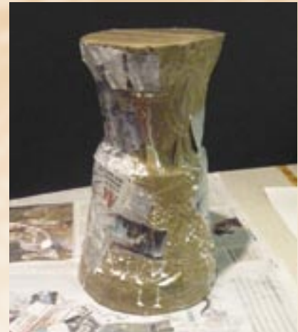
Figure 6 - Cover the drum with pieces of newspaper.

need enough pieces to cover the outside of the drum.