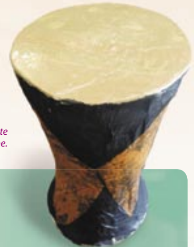
Figure 8 - Decorate your Djembe.

You could decorate your finished Djembe by painting it or with glued-on tissue paper shapes (Figure 8). Research into traditional instruments and music could provide ideas for a design.