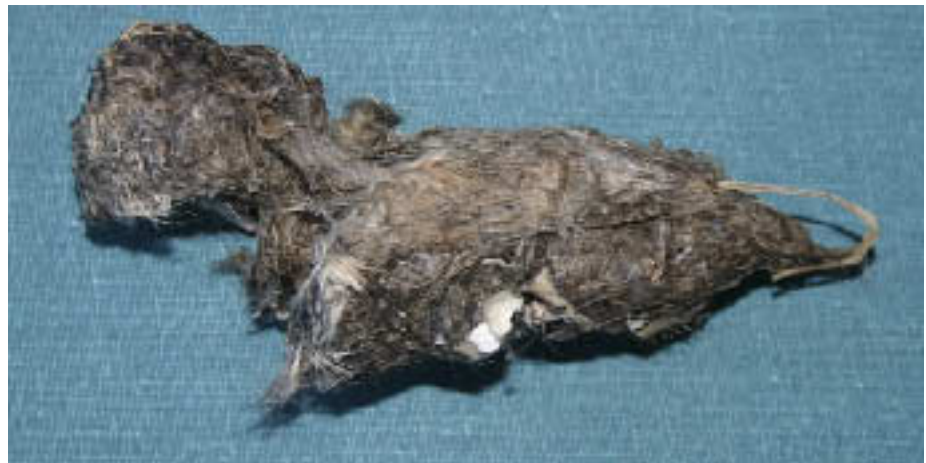
Owl Pellet

Identify with the class that other birds beside owls regurgitate pellets. Among these are crows, pelicans, and even some songbirds (songbird pellets contain hard indigestible seeds). All raptors or birds of prey (hawks, eagles, kites, owls, falcons) regurgitate pellets daily. Owl pellets are perhaps the most interesting because owls swallow many of their prey whole. By dissecting owl pellets, scientists can get an accurate record of what owls eat by reconstructing the skeletons of the animals in the pellets.